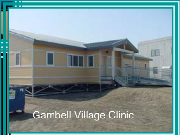
Gambell Village Clinic