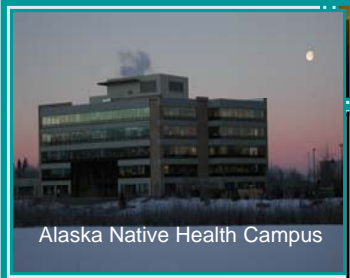
Alaska Native Health Campus