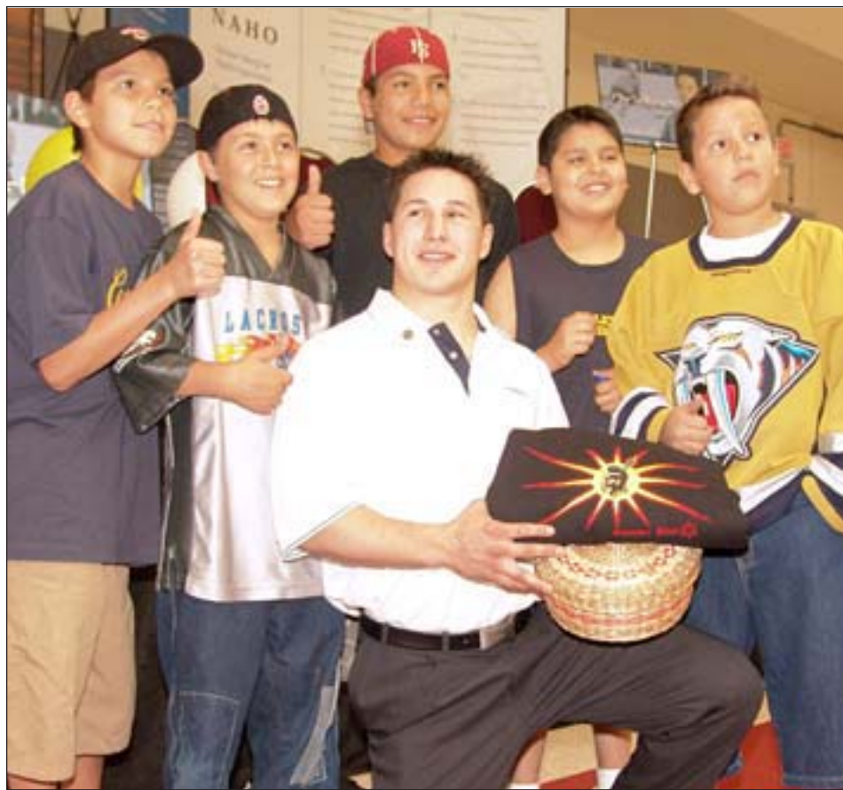
At 21, Jordin Tootoo is the first Inuk to play in the National Hockey League. Tootoo has overcome adversity and worked hard to achieve his dreams. His appearance at the launch of NAHO's National Aboriginal Role Model Program excited fans both young and old. Here, Tootoo accepts a gift from a group of young fans.