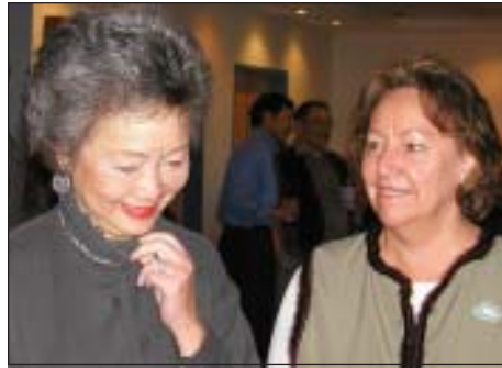
Inuit Circumpolar Conference President Sheila Watt-Cloutier shares a laugh with Governor General Adrienne Clarkson at the Stockholm Convention celebration.